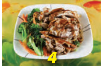
Teriyaki Chicken $12.25