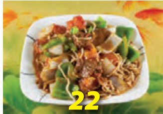
Beef Tomato Chow Mein $14.49