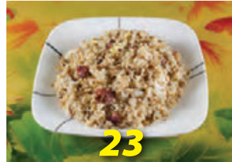
Pork Fried Rice $9.95