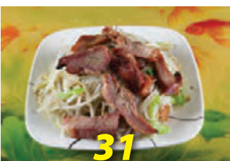
Roast Pork Chow Mein $10.99