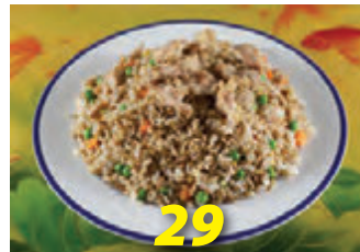
Chicken Fried Rice $10.95