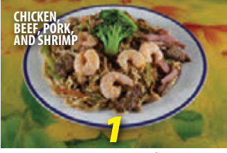
Wah's Chow Mein $13.50