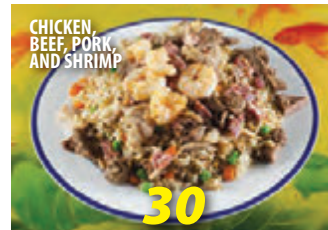
Wah's Fried Rice $12.75