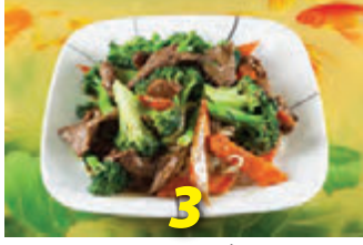
Broccoli Beef $14.49