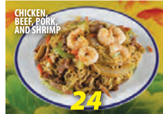
Special Hong Kong Chow Mein $14.20