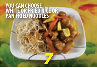
Lemon Chicken $12.95