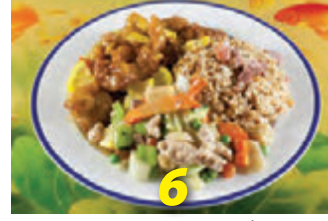
Lemon Chicken Plate $12.95