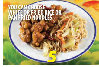
Sesame Chicken $12.50