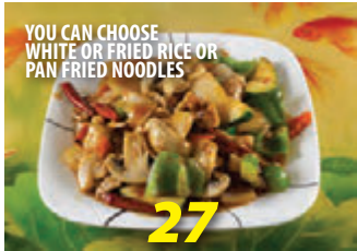
Moo Goo Gai Pan $13.24