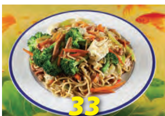
Chinese Style Chow Mein $11.20