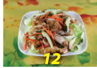
Chicken Salad $11.25