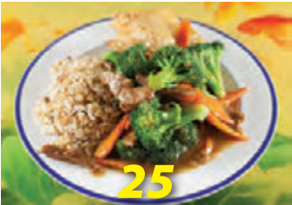
Broccoli Beef Plate $14.49