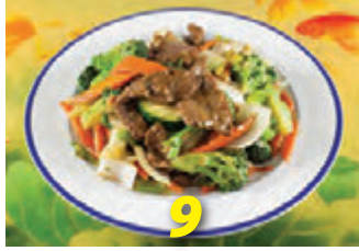
Beef Chop Suey $13.49