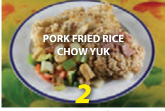
Sole Fish Plate $11.24