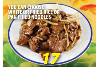
Ginger Beef $14.49