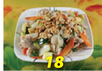
Almond Chicken $11.25