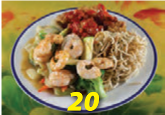
Shrimp Chop Suey Plate $13.49