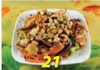
Kung Pao Chicken $12.25