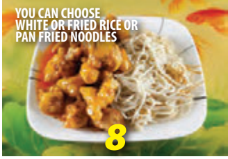
Orange Chicken $12.95