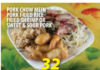
Special Plate $10.50