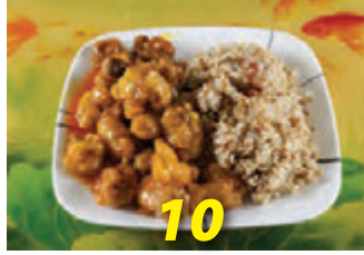
Orange Chicken with Fried Rice $12.95