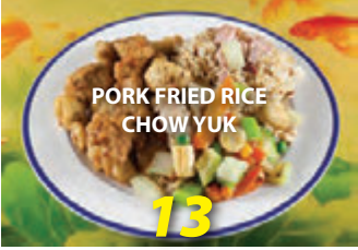
Special Chicken $10.49