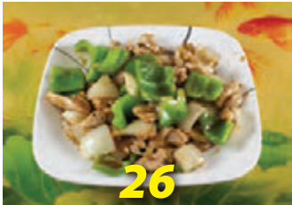
Green Pepper Chicken $12.20