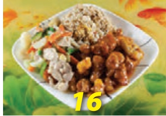
Orange Chicken Plate $12.95