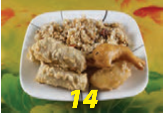
Egg Roll Plate $10.24