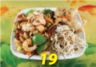
Kung Pao Shrimp Plate $14.48