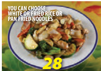
Garlic Chicken $12.25