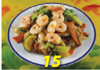
Shrimp Chop Suey $13.49